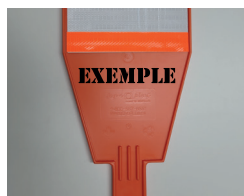
Personalized identification, custom stencil painting